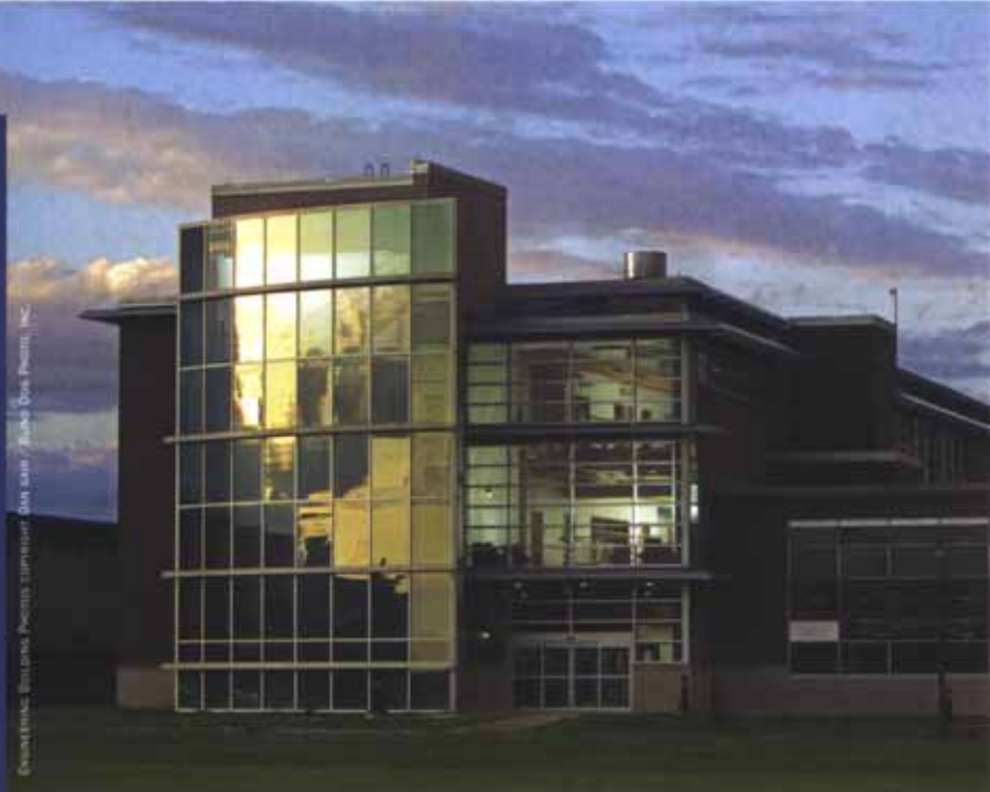
Engineering Building

Homecoming 2005 is scheduled for September 24, 2005. Mark your calendar!